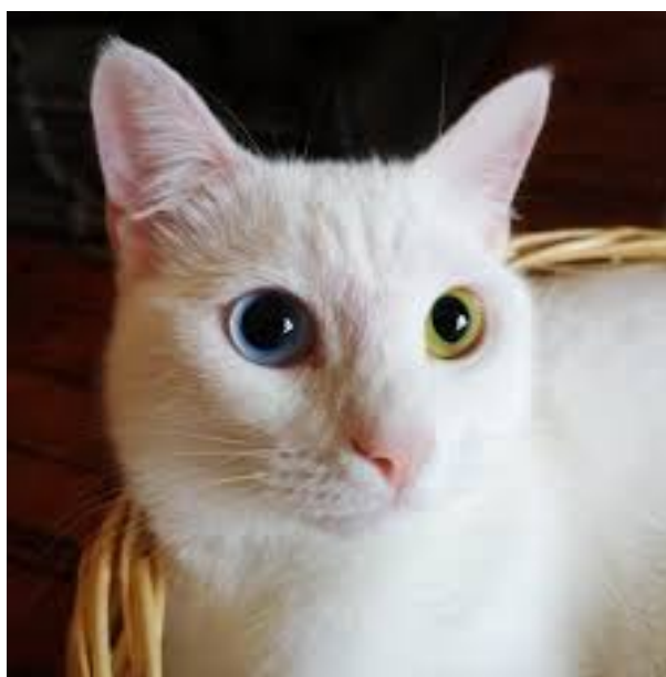
Figure 1: Here goes a caption for this picture: this is a cat

Write here your introduction and preliminary results. This includes scientific background and definition of the open issues in your field. You may include preliminary results by others in your group, as well as results you have already obtained that are relevant to your project. Now I will quote the first paper [1] like this.