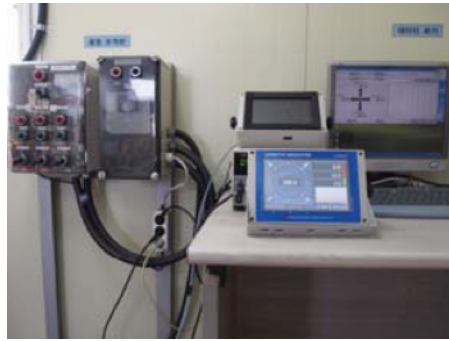
FIG. 1. A figure caption. The figure captions are automatically numbered.

is small enough to fit in a single column, while Fig. 2 is too wide for a single column, so instead the figure* environment has been used.