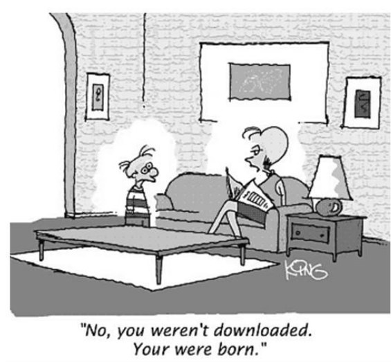
Figura 1. A typical figure

Figure and table captions should be centered if less than one line (Figure 1), otherwise justified and indented by 0.8cm on both margins, as shown in Figure 2. The caption font must be Helvetica, 10 point, boldface, with 6 points of space before and after each caption.