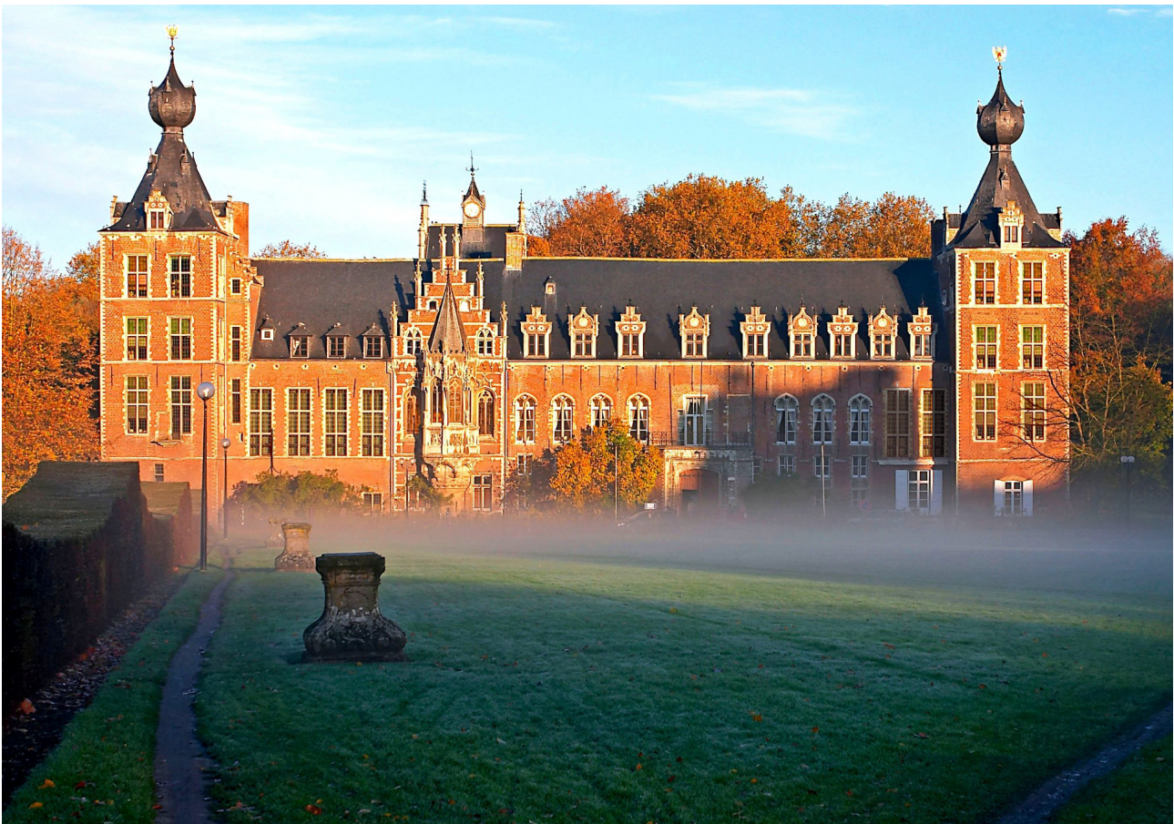
Figure 1.1: The castle of Arenberg in Heverlee, with windows corrected.

Nulla malesuada porttitor diam. Donec felis erat, congue non, volutpat at, tincidunt tristique, libero. Vivamus viverra fermentum felis. Donec nonummy pellentesque ante. Phasellus adipiscing semper elit. Proin fermentum massa ac quam. Sed diam turpis, molestie vitae, placerat a, molestie nec, leo. Maecenas lacinia. Nam ipsum ligula, eleifend at, accumsan nec, suscipit a, ipsum. Morbi blandit ligula feugiat magna. Nunc eleifend consequat lorem. Sed lacinia nulla vitae enim. Pellentesque tincidunt purus vel magna. Integer non enim. Praesent euismod nunc eu purus. Donec bibendum quam in tellus. Nullam cursus pulvinar lectus. Donec et mi. Nam vulputate metus eu enim. Vestibulum pellentesque felis eu massa. This can be seen at figure 1.1.